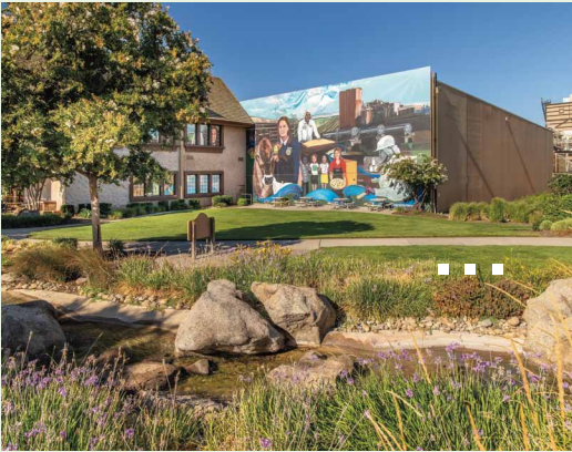
See the largest dairy mural