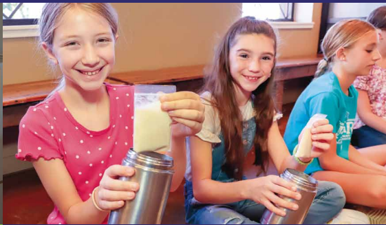
Ice Cream Activity