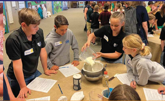
OR Cheesemaking Activity

Adjusted to be educationally appropriate for your group