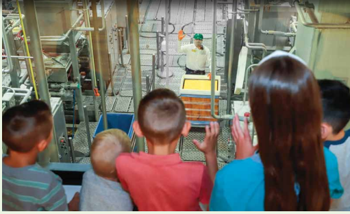
See the "Big Cheese" 640 Lb. Block